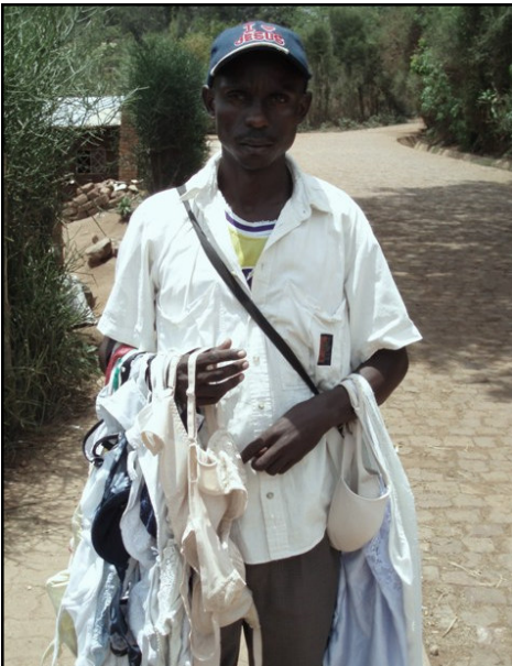
You think your job is rough? Try being a door-to-door bra salesman!