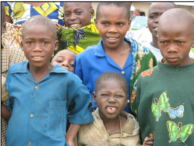
Kids from the village where one of our student's church is located.

Many times in MNC's Pastoral Training School it is obvious that the things we are teaching are confronting deep-rooted superstition, demonic strongholds and false teaching. Over the last two weeks, I (Tim) have been teaching a class on Bible Study Methods. One principle of accurate Bible interpretation that I taught says: "We must measure other knowledge about God by comparing it to the truth of