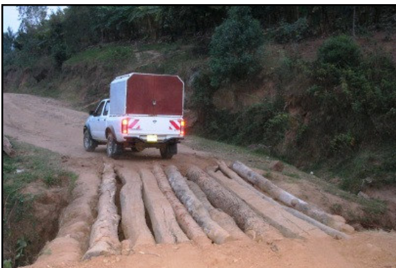
Bridge which was built while we waited!