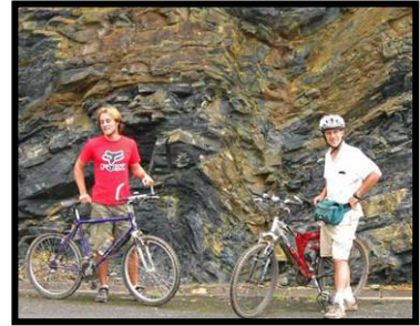
Biking over the Rwandan hills