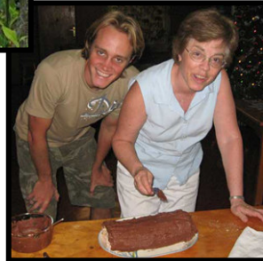
Finishing up our annual Yule Log

Pray for him as he's hit the job market back in California at just the wrong time – no job yet!