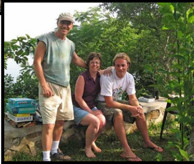
Camping at Kumbya