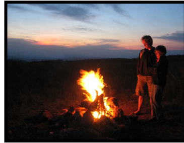
Camping in Akagera Game Park