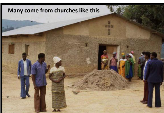
Many come from churches like this

Let me add some life to these “guys standing there” –