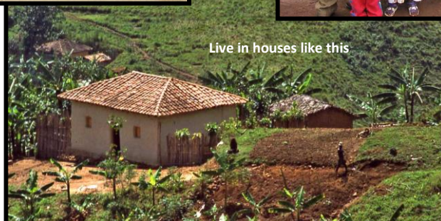
Live in houses like this