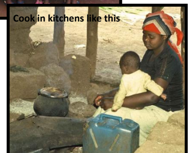
Cook in kitchens like this