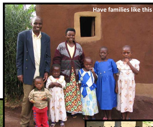
Have families like this